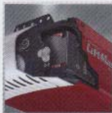
12V DC battery fits neatly inside the opener

LiftMaster® 3850, the only professionally installed opener with fully integrated EverCharge™ Battery Backup.